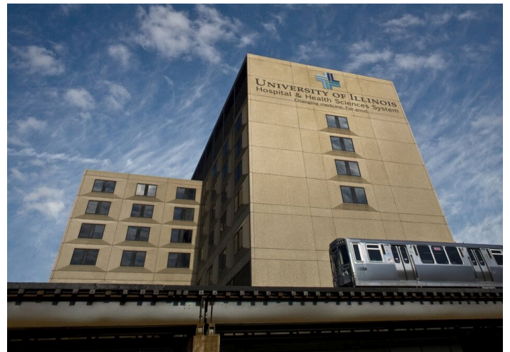
UNIVERSITY OF ILLINOIS